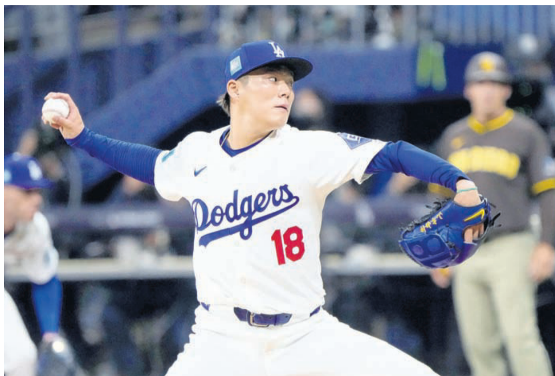
Los Angeles Dodgers starting pitcher Yoshinobu Yamamoto throws to the plate during the first inning of a baseball game against the San Diego Padres at the Gocheok Sky Dome in Seoul, South Korea Thursday, March 21, 2024, in Seoul, South Korea.

Ohtani hit three deep fly-outs on a 1-for-5 night, including a sacrifice fly, and